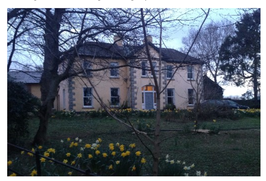
Woodside House in 2015

It is in the modern age that the estate was finally swallowed up by the growing city, 150 years after it was first bisected by the new roads. At different times parts were sold off for housing development. The main one was Aiken's Village which was developed just after the turn of the century, on the site of a pitch and putt course that was started by Frank Lenehan. When Aiken's Village was developed, Frank build a new pitch and putt course, this time around the house. The old house still survives though, and is the headquarters of a transport company.