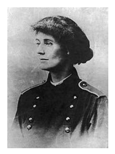
Figure 4: Countess Markoviecz

One illustrious renter was Countess Markoviecz, between 1908 and 1910. According to one publication, she came across a number of old copies of the revolutionary publications the Peasant and Sinn Féin left by a previous tenant, the poet Pádraig Colum. After reading these, Markievicz knew she had found a cause to inspire her life. Her interest in the struggle for freedom was aroused.