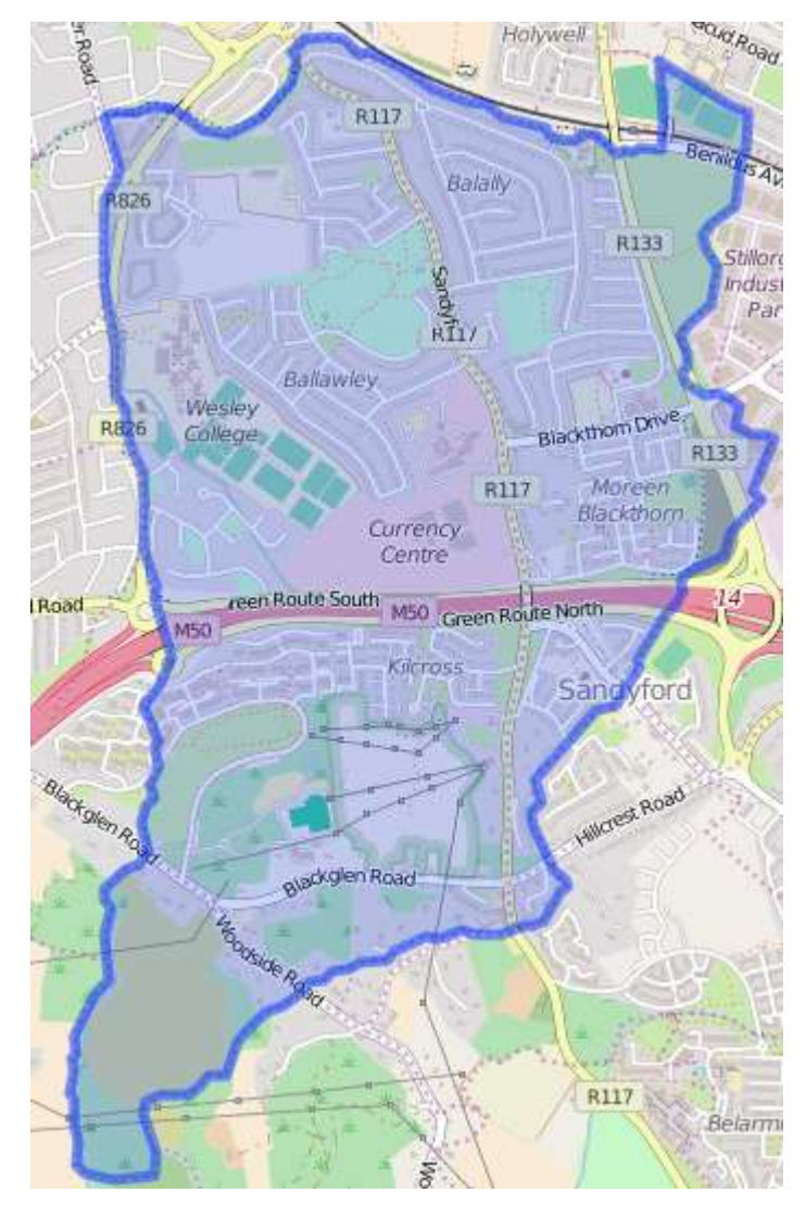
Map 1: Present Day Balally Townlond

Moreen was situated in the townland of Balally. This townland is located immediately south of Dundrum and stretches all the way down to Sandyford Village (with the boundary just south of Sandyford House) and Blackglen Road (with the boundary between this road and Slate Cabin Lane). The southern boundary is in fact following the small Glaslower stream, which comes down the mountain alongside Slate Cabin Lane, curves behind the old Lamb Doyle house opposite the shops at Lamb's Cross, and flows through Sandyford. It is joined by the culverted Kilmacud stream and flows down to Blackrock where it is now known as Carysfort-Maretimo Stream. The eastern boundary is more or less the Drummartin Link road and the western boundary the Ballinteer Road.