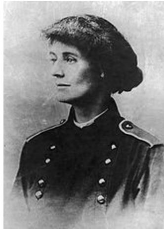
Figure 4: Countess Markoviecz

One illustrious renter was Countess Markoviecz, between 1908 and 1910. According to one publication, she came across a number of old copies of the revolutionary publications the Peasant and Sinn Féin left by a previous tenant, the poet Pádraig Colum. After reading these, Markoviecz knew she had found a cause to inspire her life. Her interest in the struggle for freedom was aroused.